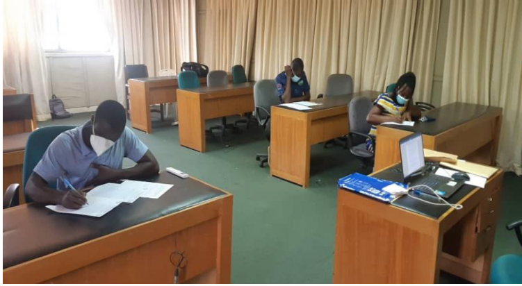
1 st and 2 nd Semester Examinations across Africa